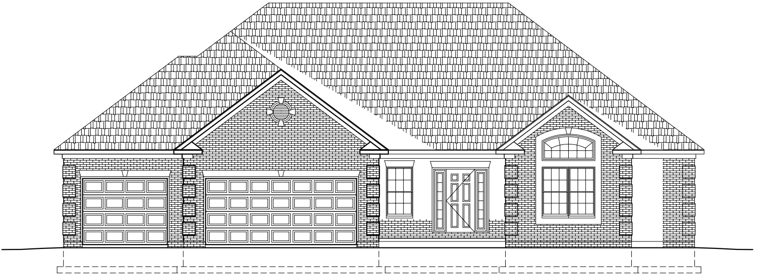
FRONT ELEVATION A-1